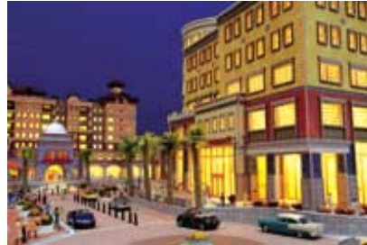
Tree-lined streets, unique boutiques, and ample parking make shopping a pleasure at Uptown Altamonte.

Staying true to Altamonte Spring's commitment to environmental responsibility, the development's master plan is driven by ecological factors. For instance, the generous allotment of landscaped and park-like areas will be sustained through the city's renowned storm-water retention system, eliminating the need to dip into Florida's precious aquifer for irrigation purposes. Passersby, who hear the tranquil flow of water under a faux bridge, will be surprised to know that an innovative water-filtering system, designed to inhibit sediment build-up in the lake, is hard at work, ultimately promoting the health and protection of the delicate Wekiva River ecology.